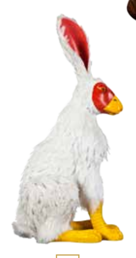
What Would Lay a Chocolate Egg? by Caoimhe Dunn